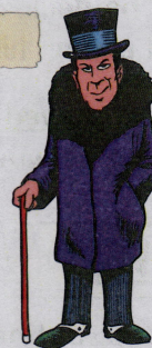
THE PRINCE ruler of Verona

Capulet wants to arrange a marriage between Paris and Juliet