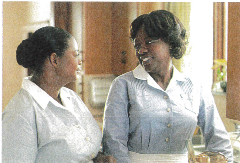
On the left Octavia Spencer as Minnie Jackson and on the right Viola Davis as Aibileen Clark

In pairs, take turns describing the pictures p. 145, p. 147 and here below to each other. Together, discuss which themes from the film are expressed through these images. Argue your point. Afterwards, walk around the classroom in pairs and compare your answers.