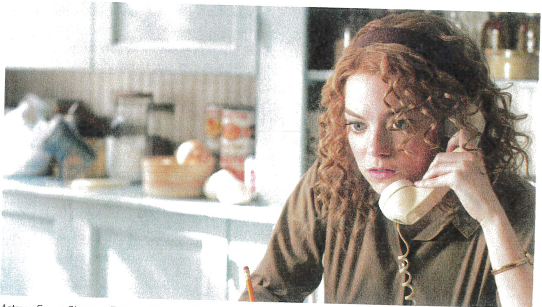
Actress Emma Stone as Eugenia 'Skeeter' Phelan in The Help

In pairs/small groups, answer the following question: What is the point of writing a novel that takes place more than 50 years ago?